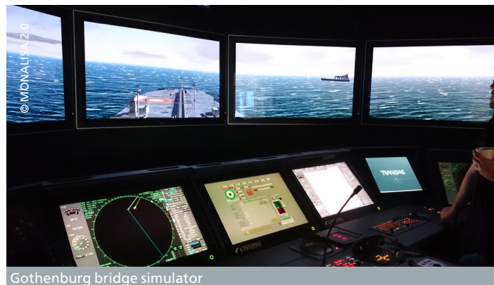
Gothenburg bridge simulator

An essential subgoal for the development of this maritime traffic management system was reached in December 2014 when simulations within a network were implemented to assess the feasibility of the developed solutions. Together with participants in Spain, Sweden and Finland, the Fraunhofer CML demonstrated for the first time in a one-week simulation run that a combination of ship simulators produced by various manufacturers is possible. Every simulator connected to the network controlled a vessel from its bridge in an everyday traffic situation in