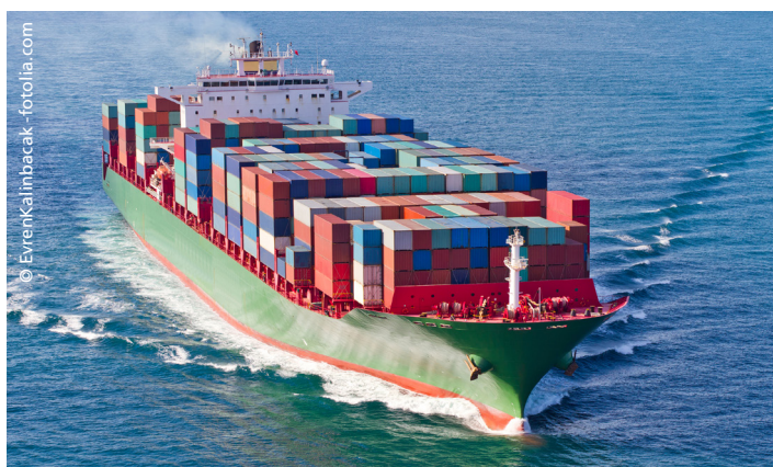
Inevitable: After-sales services for global shipping