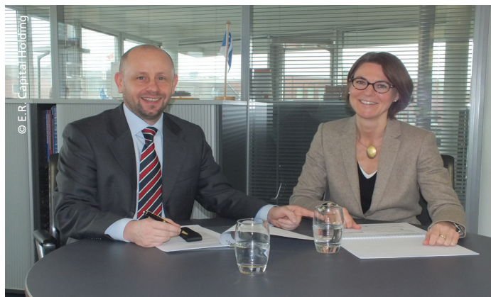
Satisfied: Good results of the employee survey